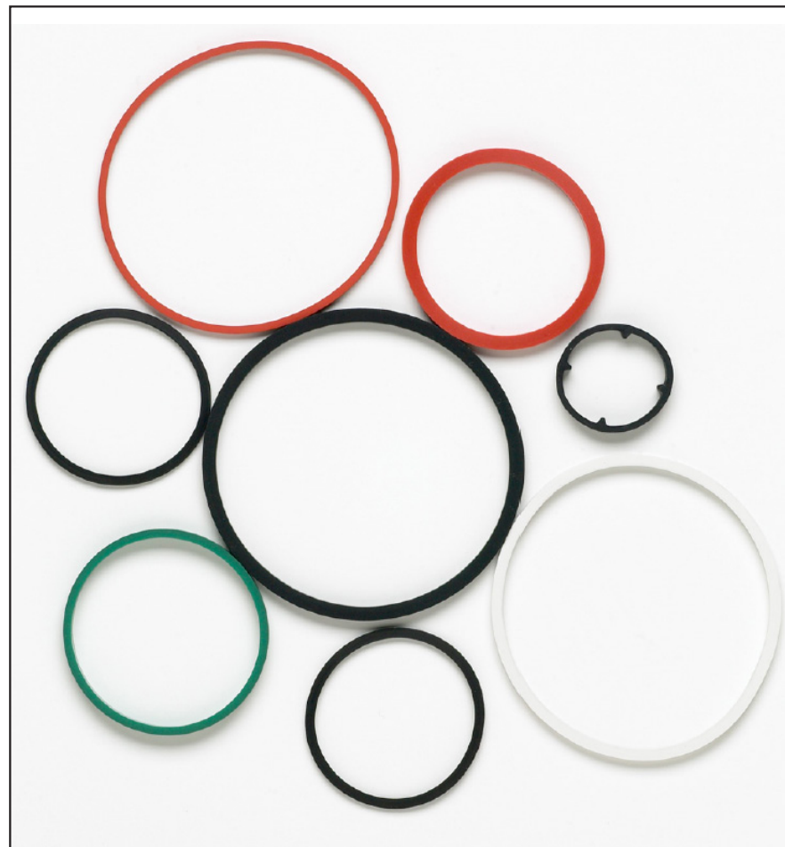
Lathe cut seals in various sizes, cross-sections, and colors